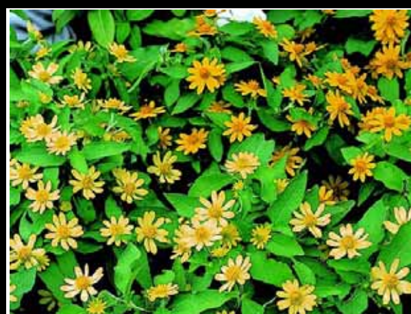
Melampodium Million Gold (top) and Lemon Delight (bottom)